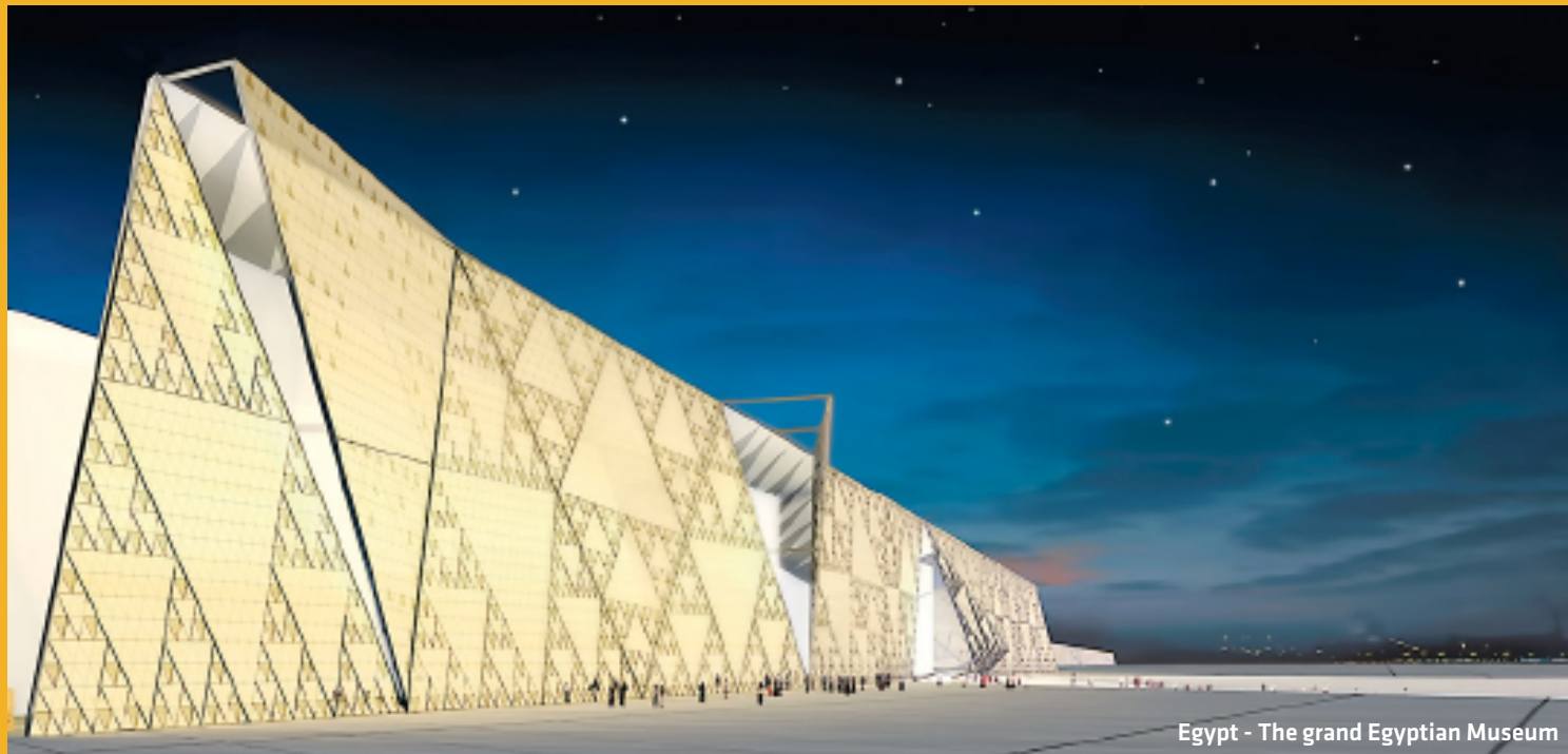
Egypt - The grand Egyptian Museum